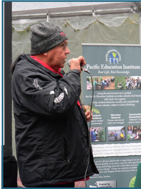
Muckleshoot Tribal Workshop

PEI Mission: Using the environment as a context, the Pacific Education Institute provides schools and teachers with tools and support to help students become socially and scientifically literate citizens, adept at critical thinking and engaged in a lifetime of discovery.