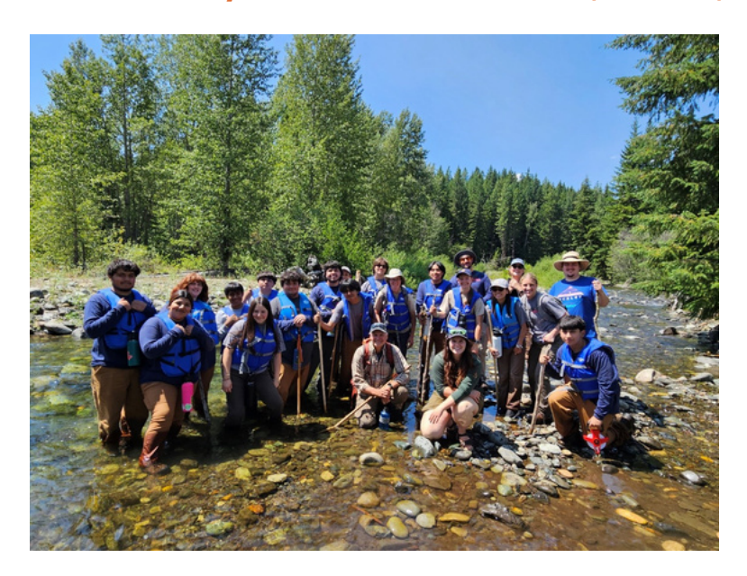
Yakima Valley Technical Skills Center YESS crew