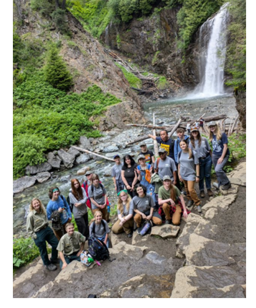
Riverview YESS Crew

Franklin Falls Oxbow Farm and Conservation Center King County Basin Stewards Snoqualmie Valley Preservation Alliance